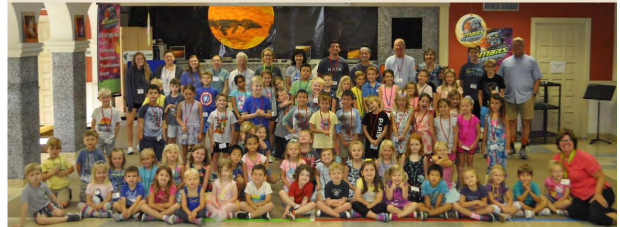
2019 Vacation Bible School