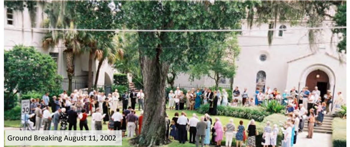
Ground Breaking August 11, 2002