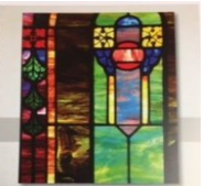
Park Lake Presbyterian Church 309 E. Colonial Drive, Orlando, FL 32801 PLPC.org • 407-841-6550 Spring 2019

Park Lake's Church Directory is now available in mobile form. Our directory link will appear on the PLPC website, in the weekly Park Lake Up To Date and in the newsletter. The mobile directory has all the information that is in the print directory, just for you when you're on the go, the link is-- mobiledirectory.lifetouch.com/357841/park-lake-presbyterian-church Members will be given an access code to fully use the Mobile Directory.