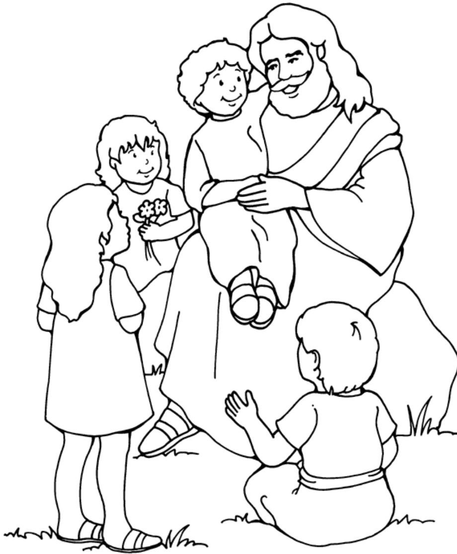
Jesus and the Children

From Thru-the-Bible Coloring Pages for Ages 4-8. © 1986, 1988 Standard Publishing. Used by permission. Reproducible Coloring Books may be purchased from Standard Publishing, www.standardpub.com , 1-800-543-1301.