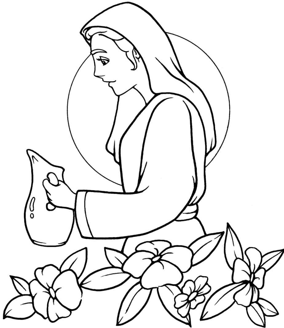
A Bride for Isaac Genesis 24:1-67

Copyright © CalvaryCurriculum.com Used by Permission