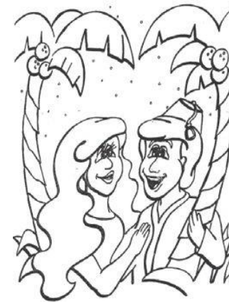
Isaac and Rebekah