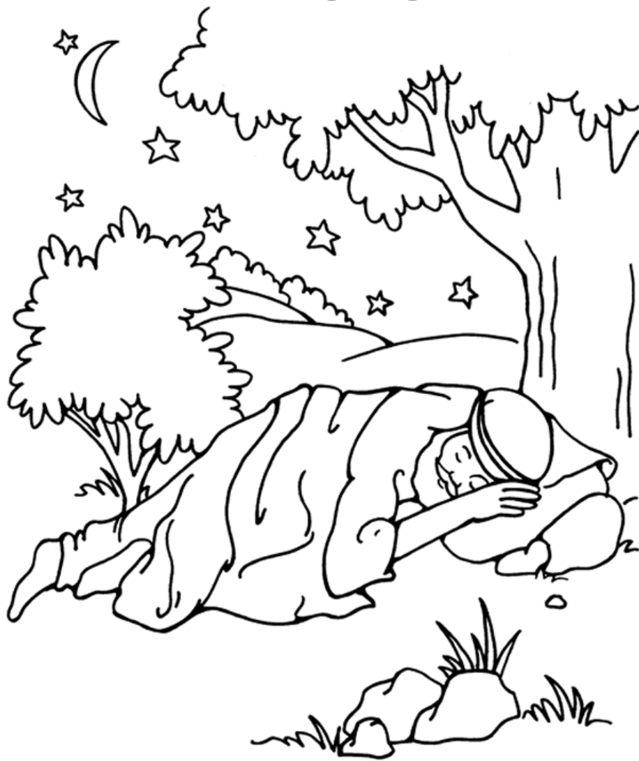
God Cares for Jacob