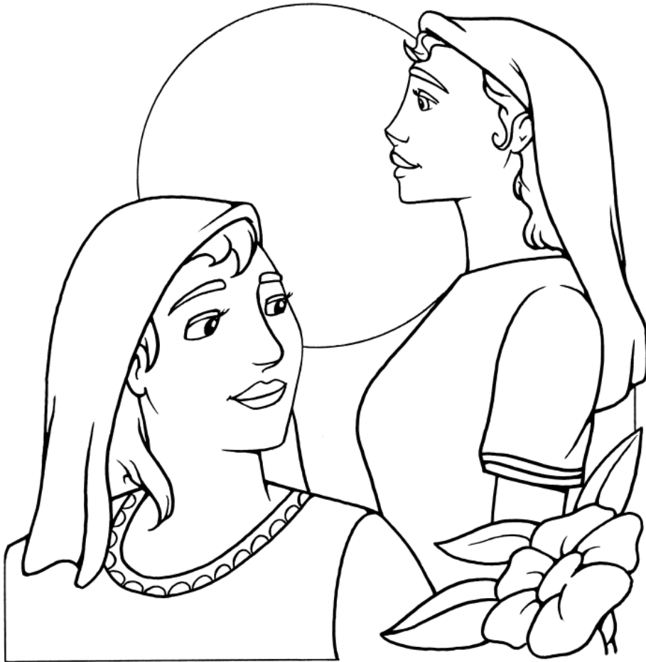
Leah and Rachel

Now Laban had two daughters; the name of the older was Leah, and the name of the younger was Rachel.