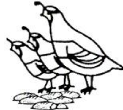
Manna & Quail