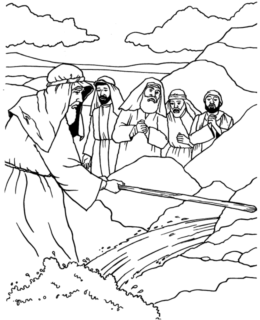
Moses Strikes the Rock Exodus 17:1-7

From BibleStoryCard Learning System(tm) Coloring Book © 1996 Wesleyan Publishing House Used by permission. Additional BibleStoryCard resources available by calling 1-800-493-7539 or visiting online http://www.parable.com/wph/group_1052.htm