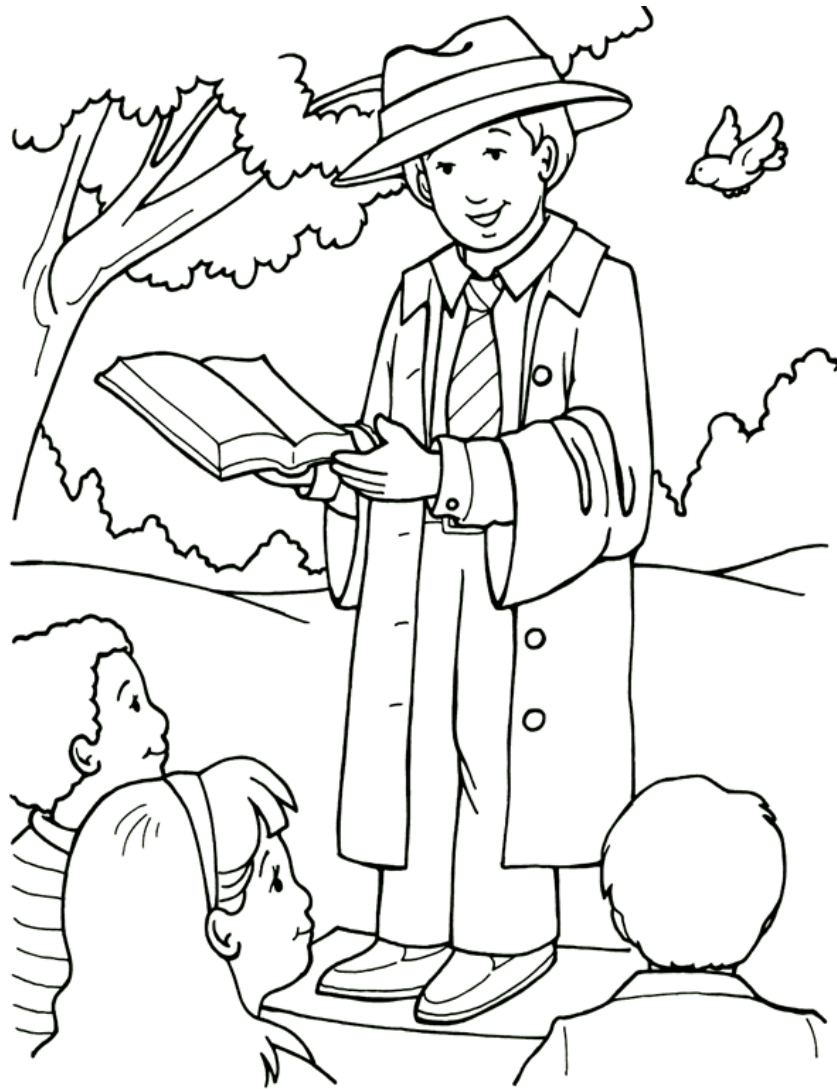
Inviting others to Jesus.

Each number represents a letter of the alphabet. Substitute the correct letter for the numbers to reveal the coded words.