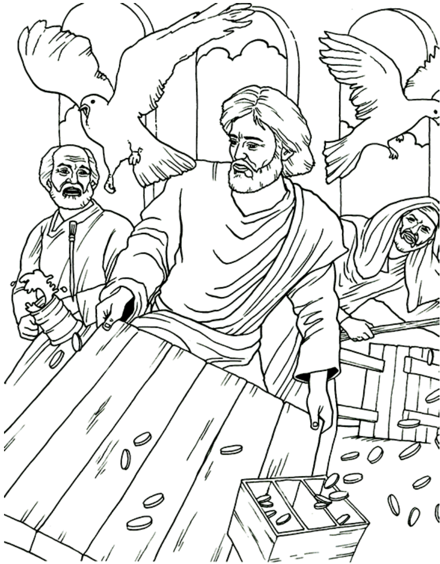
Jesus Cleansing the Temple

From BibleStoryCard Learning System(tm) Coloring Book © 1996 Wesleyan Publishing House Used by permission. Additional BibleStoryCard resources available by calling 1-800-493-7539 or visiting online http://www.parable.com/wph/group_1052.htm