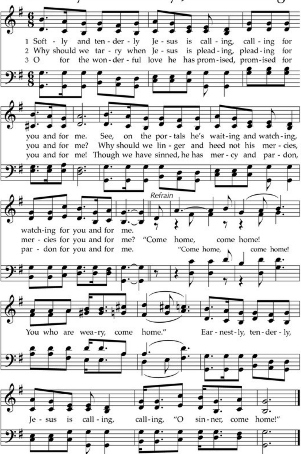
This 19th-century gospel hymn has often been used as a hymn of invitation at evangelistic services. Its imagery is primarily based on Jesus' parable in Luke 15:11–32, commonly called "The Prodigal Son." Each singer thus becomes a wandering child who is urged to return home.