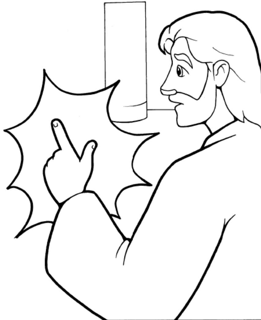
Jesus Appears to the Disciples