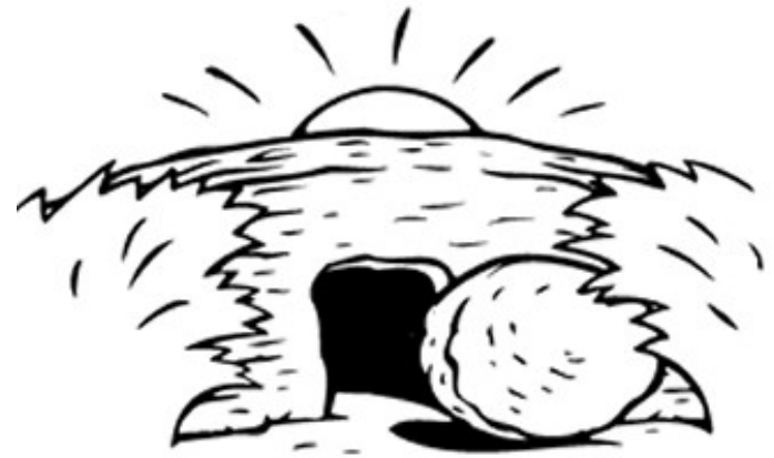
"He has risen! He is not here." Mark 16:6