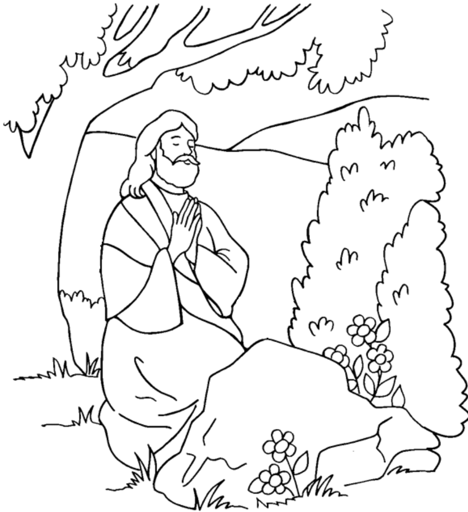
Jesus Prays for His Disciples