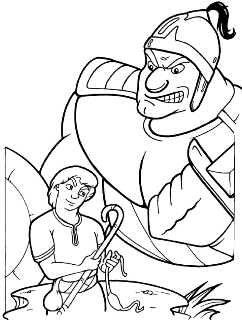
David & Goliath 1 Samuel 17:32-49

Copyright © CalvaryCurriculum.com Used by Permission