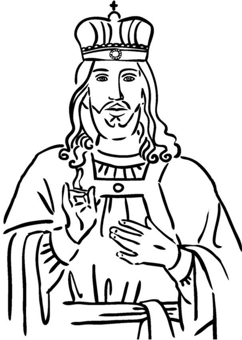
Christ the King John 18:33-37