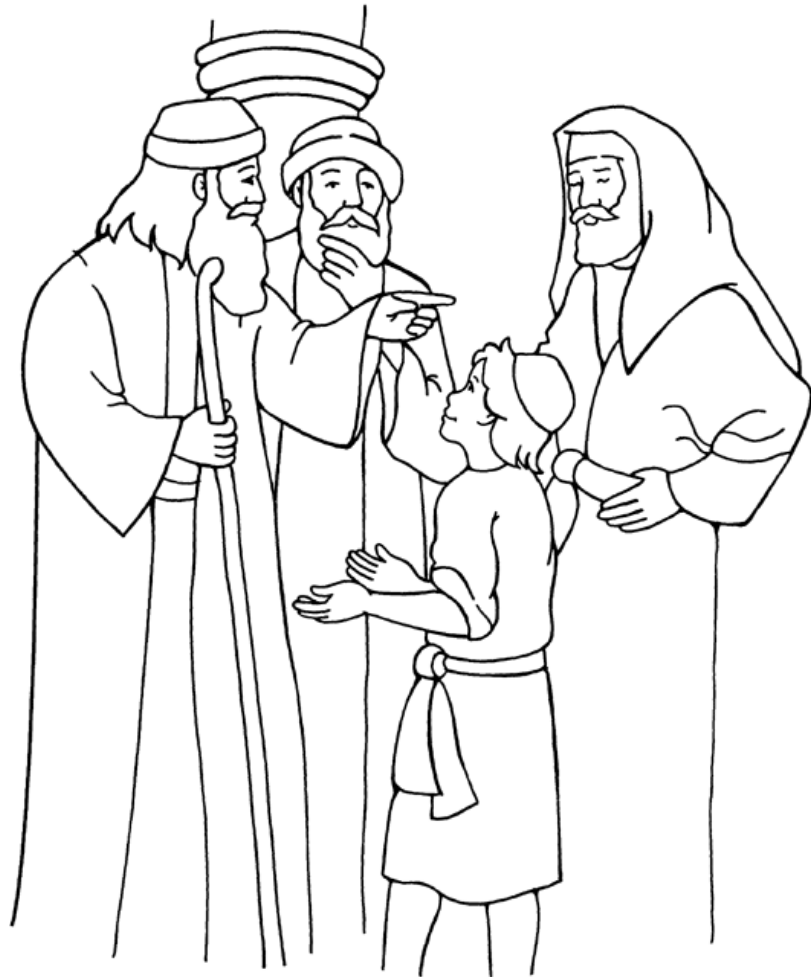
Jesus in the Temple Luke 2

From Thru-the-Bible Coloring Pages for Ages 4-8. © 1986, 1988 Standard Publishing. Used by permission. Reproducible Coloring Books may be purchased from Standard Publishing, www.standardpub.com .