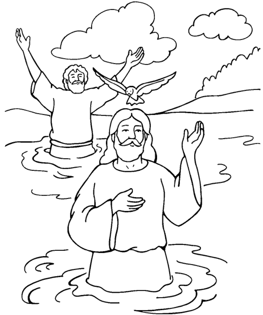
John Baptizes Jesus Matthew 3, Mark 1, Luke 3

From Thru-the-Bible Coloring Pages for Ages 4-8. © Standard Publishing. Used by permission. Reproducible Coloring Books may be purchased from Standard Publishing, www.standardpub.com , 1-800-543-1301.