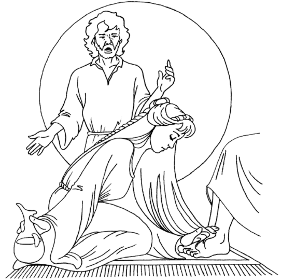
Mary Anoints Jesus' Feet John 12:1-8

Then Mary took about a pint of pure nard, an expensive perfume; she poured it on Jesus' feet and wiped his feet with her hair. John 12:3a (NIV)