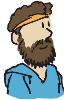
Esau skillful hunter

Circle the 3 things that relate to each brother.