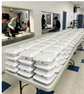
Helping with lunch assembly at Daily Bread (Christian Service Center)